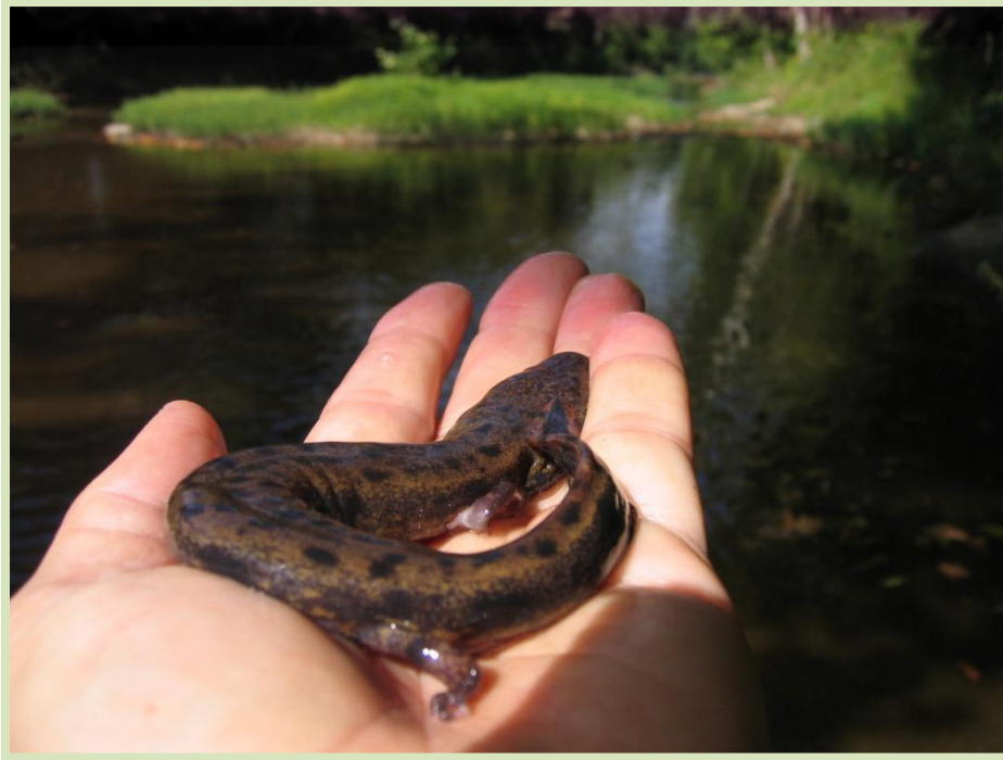
Figure 3. Stressed mud puppy observed on Dunkard Creek during kill event, September 10, 2009.