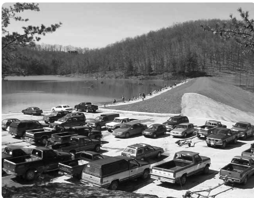
The Teter Creek Lake access site was developed with funds from the Sport Fish Restoration Program.

SFRP-funded projects directly related to sport fish restoration is a cooperative effort involving federal and state government agencies, the sport fishing industry, anglers and boaters. The program has helped state wildlife agencies restore and manage