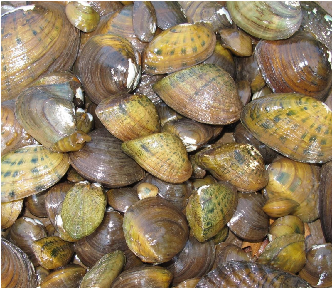
Middle Island Creek mussels including federally endangered Snuffbox.