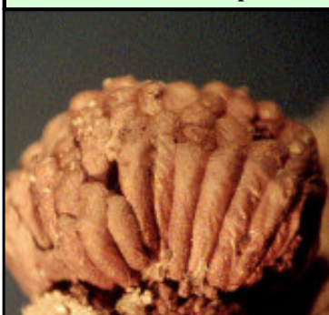
15 Tubifera ferruginosa