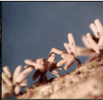
2 Arcyria cinerea