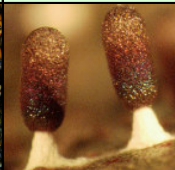
13 Diachaea leucopodia