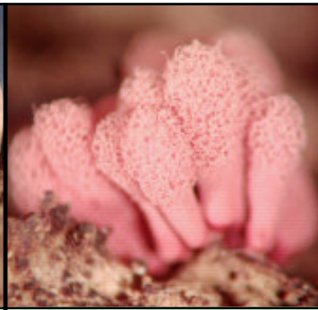
3 Arcyria denudata