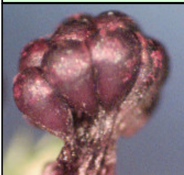
11 Metatrachia vesparia