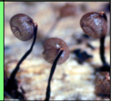
6 Cribraria cancellata