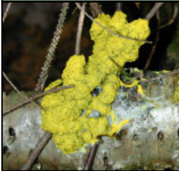
5 Fuligo septica