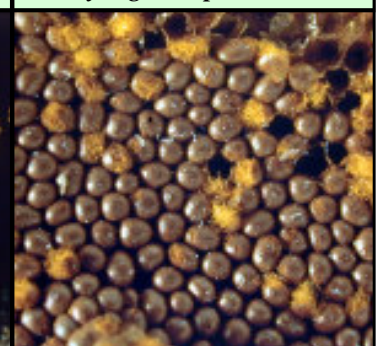
18 Trichia favoginea