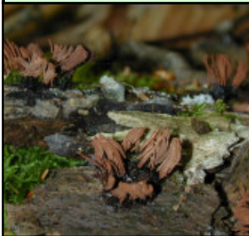
7 Stemonitis axifera