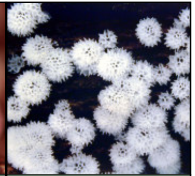
4 Ceratiomyxa fruticulosa