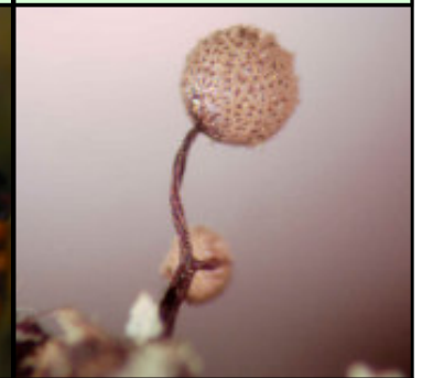
10 Cribraria intricata