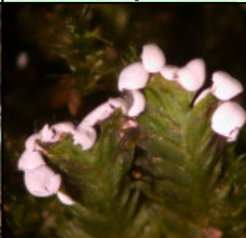
8 Diderma effusum