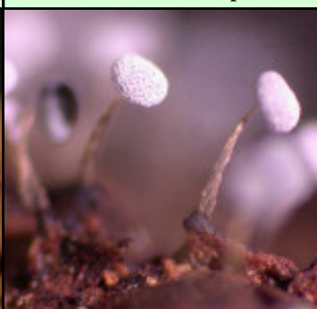
16 Physarum nutans