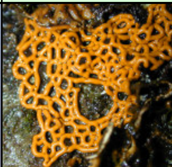
12 Hemitrachia serpula