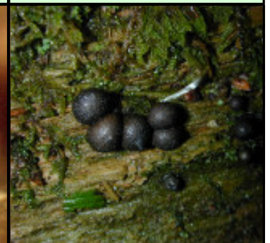
14 Lycogala epidendrum