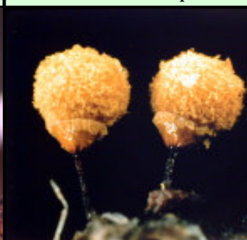
17 Hemitrachia calyculata