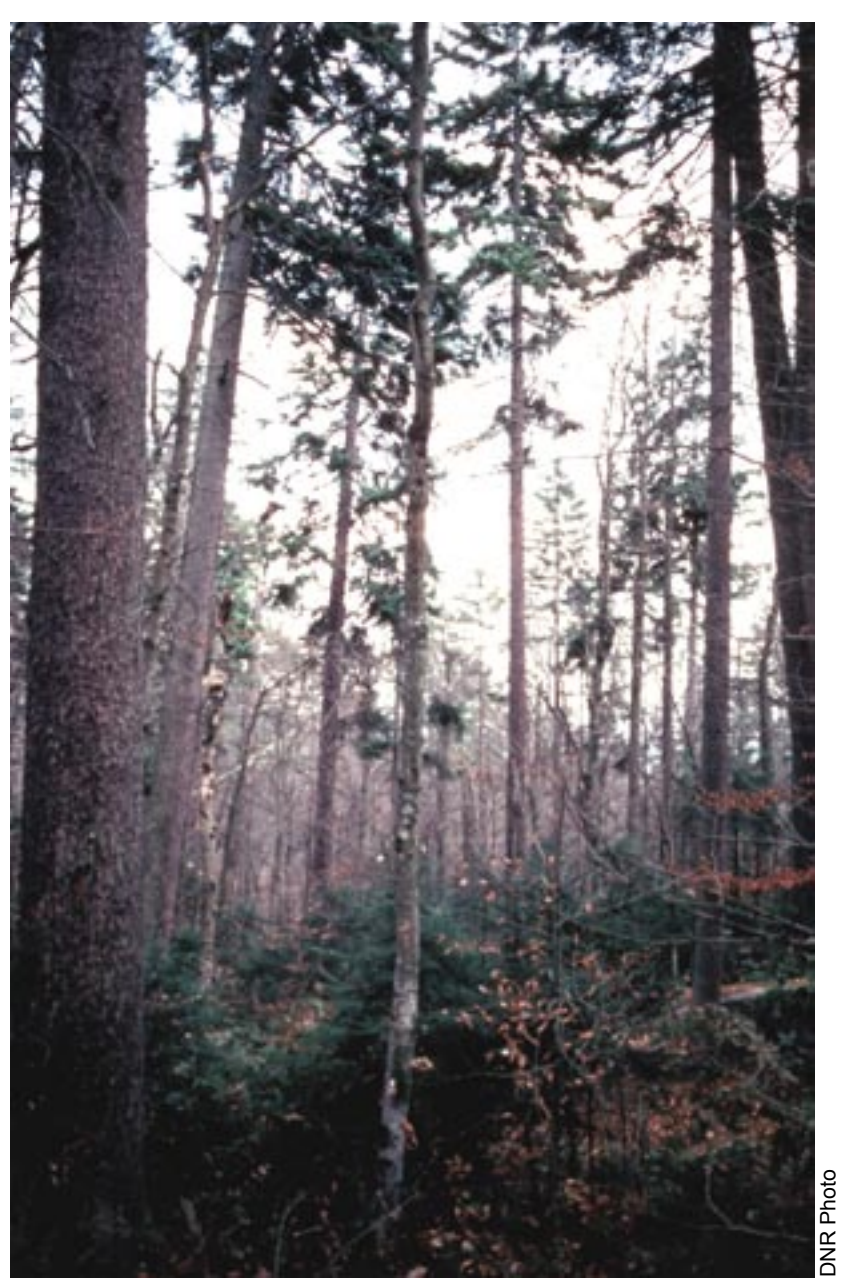
Woodland salamander habitat containing yellow birch and red spruce.