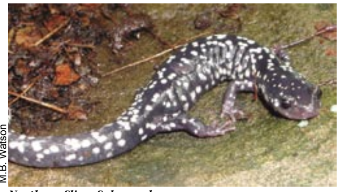
Northern Slimy Salamander

Mating probably occurs in the autumn and egg deposition in May and June. Eggs hatch in late summer and autumn.