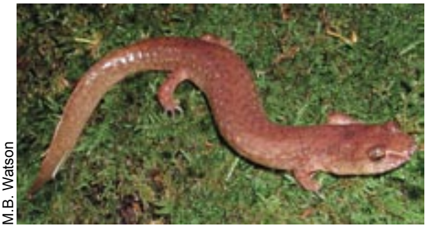
Nortbern Spring Salamander

Kentucky Spring Salamanders ( Gyrinophilus p. duryi ) occur in the southwestern part of the state and Northern Spring Salamanders ( G. p. porphyriticus ) are found throughout the remainder of the