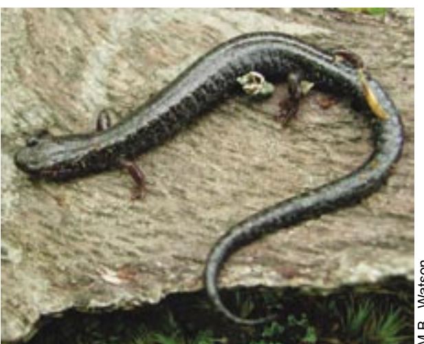
Valley and Ridge Salamander

Valley and Ridge Salamanders are found from Summers and Monroe counties north through the eastern panhandle. Shenandoah Mountain Salamanders occur on Shenandoah Mountain in Pendleton, Hardy, Hampshire and Grant counties.