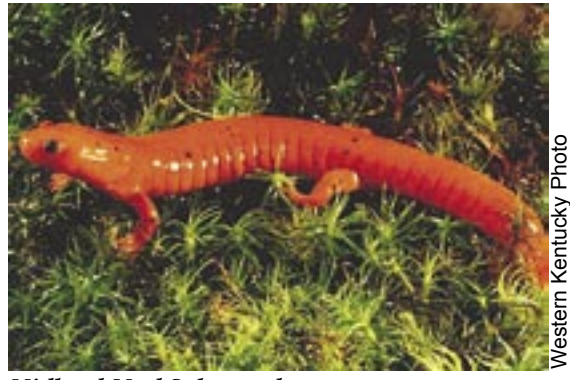
Midland Mud Salamander

Midland Mud Salamanders are red with 30 to 40 distinct black spots scattered over the upper surface of the head, back and dorsum of the tail. The undersurface is unmarked except for an occasional dark line on the edge of the lower jaw. Length may reach 6 inches.