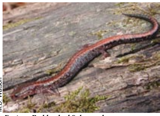
Eastern Red-backed Salamander

These small, slender salamanders are the most common woodland salamanders in West Virginia. They usually have a straight-edged red to gray dorsal stripe. Some specimens lack the dorsal stripe and are referred to as the lead-backed morph. The bellies of both color varieties are speckled black and white.