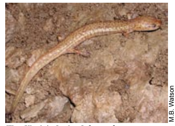
West Virginia Spring Salamander

As far as it is known, the reproductive biology is similar to the Northern Spring Salamander.