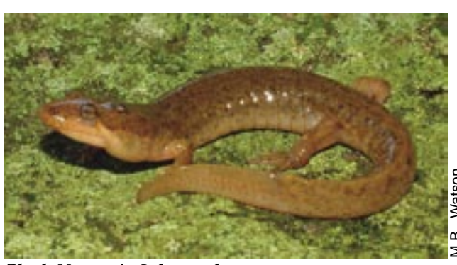
Black Mountain Salamander

Black Mountain Salamanders are nearly as large as Black-bellied Salamanders reaching 6 to 7 inches in length. The back pattern varies but usually is light brown to gray-green with