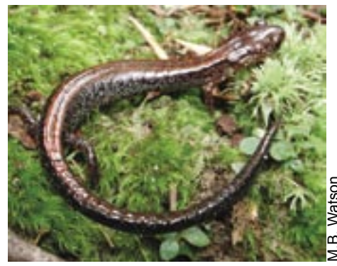
Eastern Red-backed Salamander

Although the word amphibian means double life because many amphibians leave terrestrial habitats and return to water to deposit eggs, many species of salamanders are not obligated to this lifestyle. Most species that live in forests do not return to water to deposit eggs but lay them in moist terrestrial habitats, such as under rocks, logs and in rock crevices. Unlike reptiles, amphibians have a larval stage.