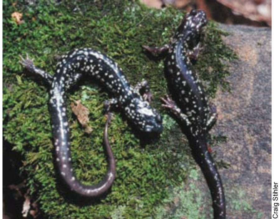
The White-spotted Slimy Salamander, left, and the Cow Knob Salamander are difficult to distinguish from each other.

Cow Knob Salamanders are found along the Virginia border in Pendleton, Hardy and Hampshire counties.