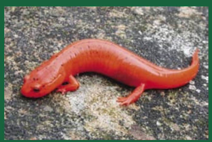
Northern Red Salamander

WEST VIRGINIA DIVISION OF NATURAL RESOURCES WILDLIFE RESOURCES SECTION