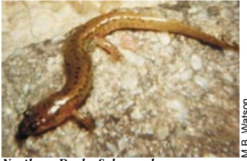
Northern Dusky Salamander

seeps, springs and small streams. About 10 to 20 eggs are deposited from June to July in cavities under rocks, logs, leaves, or mosses close to water. Nests are guarded by the female and eggs hatch in late summer or early autumn. Larvae transform into juveniles in about one year.