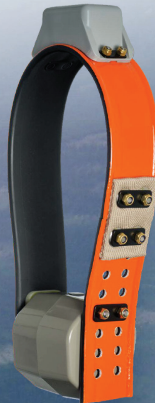
VERTEX Lite collar for Ungulates