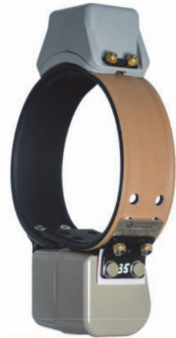
VERTEX Lite collar for Carnivores