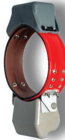
Round shaped VERTEX Lite collar with 1C battery and Drop Off