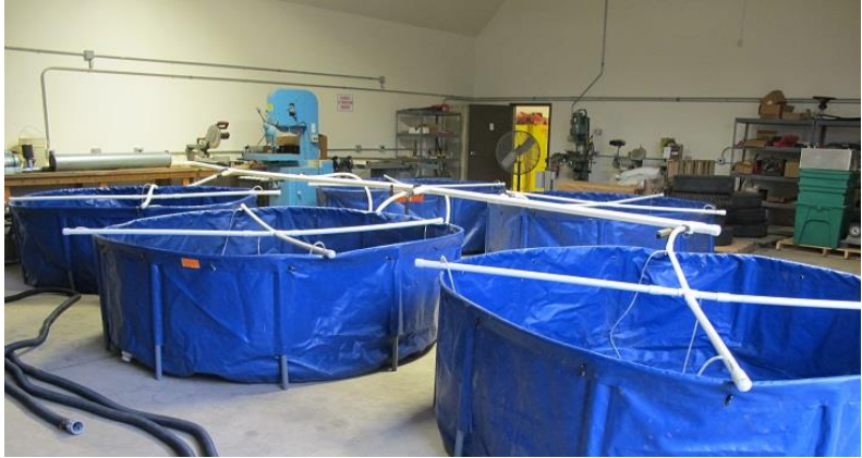
Figure 3. Temporary quarantine tanks at USFWS Middle Island facility.

Quantitative three random start systematic surveys as well as qualitative surveys were conducted at the Blacksville, DOH Garage and Mason Dixon sites in June 2015. While no recruitment was observed for any of the native freshwater mussel species there were live adult tagged mussels recovered from previous translocations (Figures 5 and 6). Thirty-two mussels of six species were recorded during those surveys. The Asiatic Clam, Corbicula fluminea , and other aquatic life including fish, insects and crayfish continue to thrive in these areas. On 8 Jun