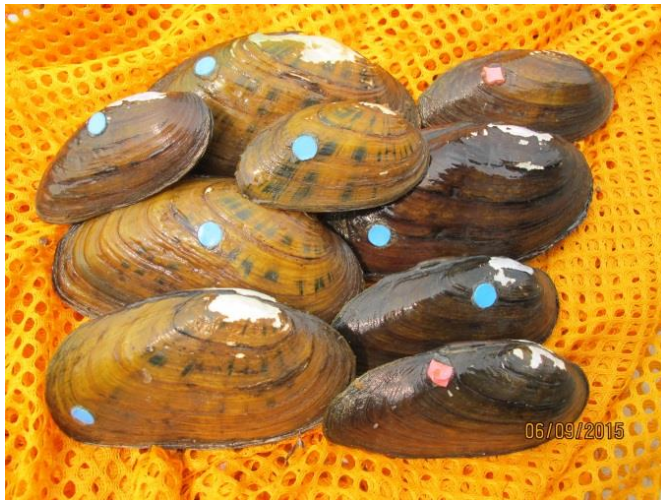
Figure 6. Previously stocked adult freshwater mussels recovered during quantitative surveys in Dunkard Creek in June 2015.

The WVDNR would like to thank the Pennsylvania Fish and Boat Commission for their cooperation that has permitted salvaged mussels from Pennsylvania to be used for restoration