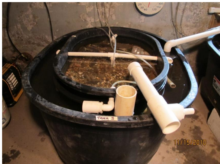
Figure 2. Mussel holding tank at WVDNR Belleville Complex used for over-wintering broodstock.

Host fish inoculations have typically been conducted using two different methodologies. Smaller fish were inoculated while being held within the hauling tank. If the fish were in the tank for any length of time the water was changed to reduce the amount of fish slime within the water. Mussel larvae were extracted from the broodstock and placed into the hauling tank with the fish. The tank was aerated which aided in keeping the larvae moving within the tank to increase the rate of inoculation. Larger fish like the Freshwater Drum were inoculated by using a syringe