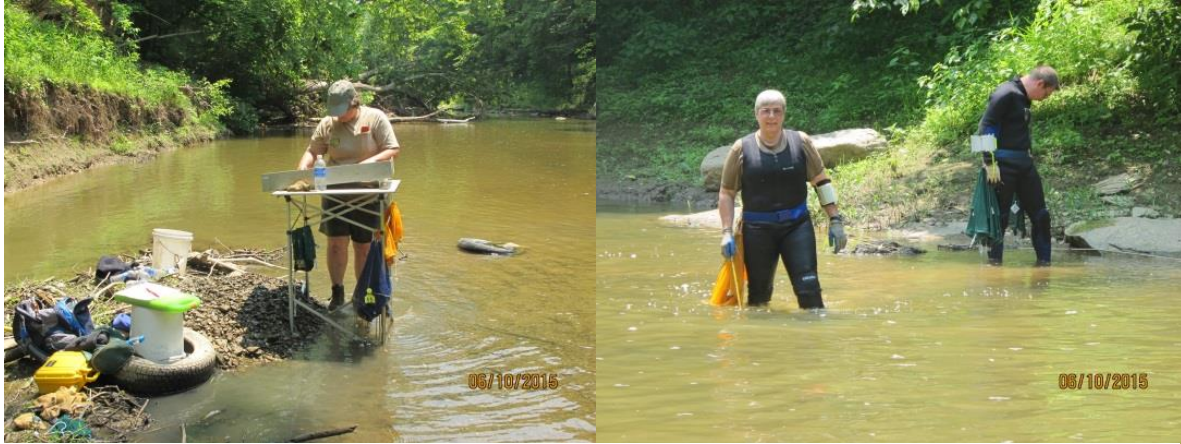
Figure 5. Dunkard Creek quantitative three random start systematic surveys conducted by the WVDNR, Monongalia County, WV.

2015 a qualitative survey was conducted downstream of the Buckeye low water bridge where inoculated Freshwater Drum have been released to look for recruitment but no live mussels were encountered. The same day a reconnaissance survey was also conducted to identify a possible additional monitoring site between Buckeye and Mason Dixon Park.