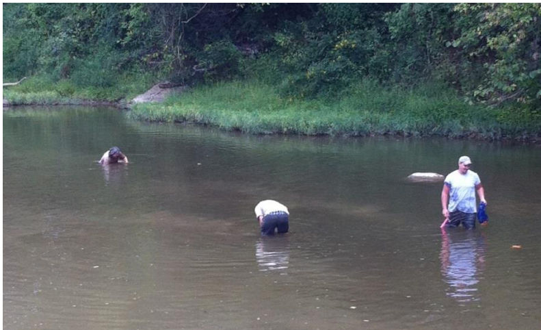
Figure 4. Stocking of common mussels into Dunkard Creek at Blackville, Monongalia County, WV. September 2015.